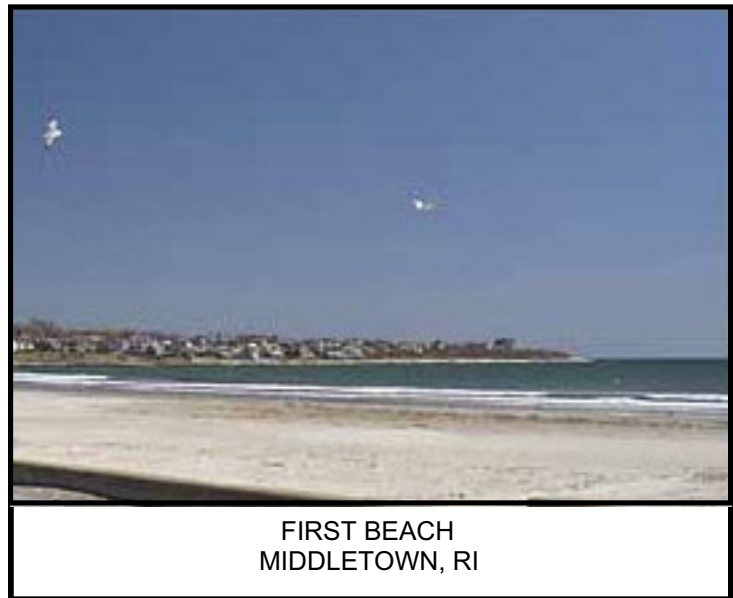
FIRST BEACH MIDDLETOWN, RI

Comments: Eat at Flo's Clam Shack, and the Atlantic Grill in Middletown.