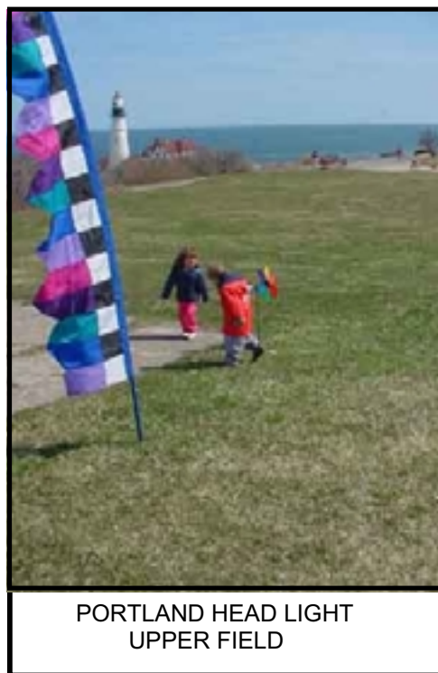
PORTLAND HEAD LIGHT UPPER FIELD

Facilities: Free parking, Porta-Johns (In Season), Walking Paths, Picnic Tables, Charcoal Grills, Gift Shop (In Season), Lighthouse Tours (Weekends, In Season)