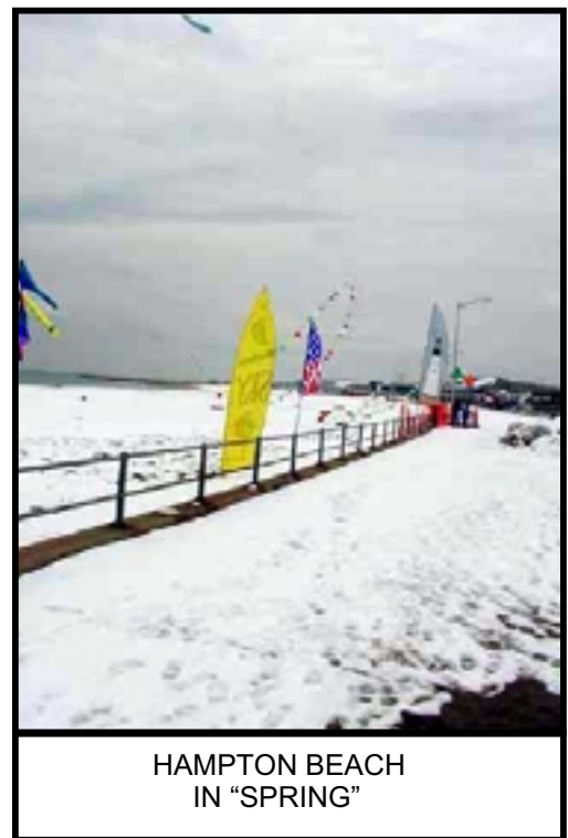
HAMPTON BEACH IN "SPRING"

Facilities: Free parking along breakwater. Ashworth Hotel / Restaurant, Paved walking path along beach.