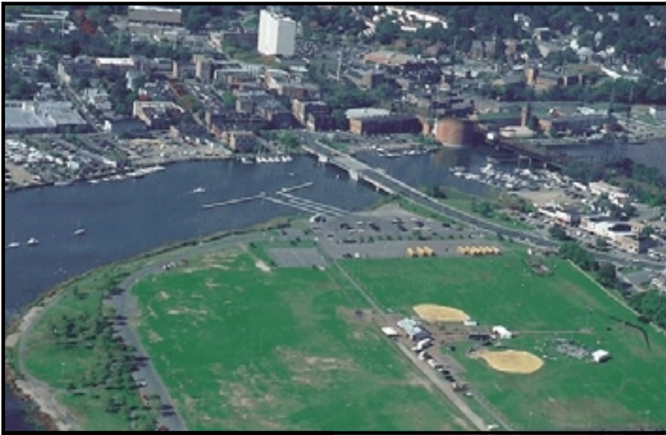
VETERAN'S MEMORIAL STATE PARK

If that one is closed, continue to and thru traffic light, and take first entrance on left, go thru parking lot to field.